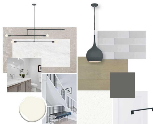
#2, 3550 45 STREET SW MOOD BOARD - FINISHES & SPECIFICATIONS

*Images are for inspiration purposes only.