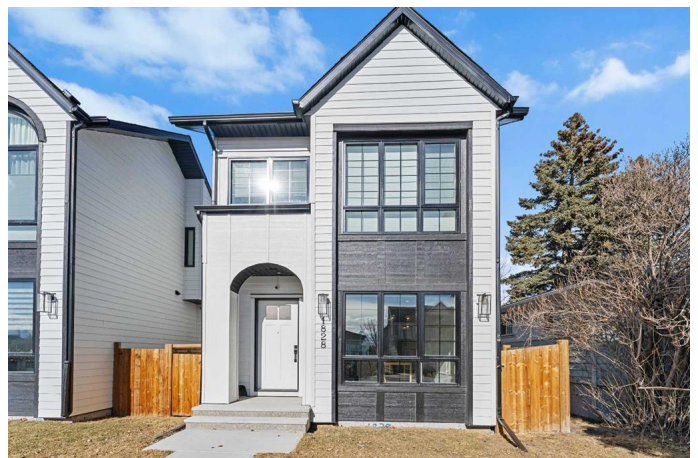
Client: Tri Nhan Le - EXP Realty Address: 1828 18 Ave NW, Calgary Level: Basement