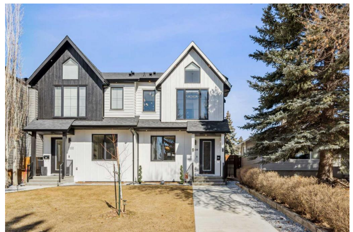
2130 53 Ave SW, Calgary, AB

Main Floor Exterior Area 949.36 sq ft Interior Area 678.23 sq ft