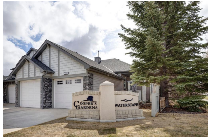
160-100 Coopers Common SW, Airdrie, AB

Step into the vibrant heart of Coopers Crossing and claim this rare end-unit bungalow villa, where modern elegance meets unbeatable location. Backing onto the community's scenic pathway system, this home boasts a sun-drenched south-facing deck and yard—perfect for savouring morning coffee or evening sunsets. Inside, meticulous care and recent upgrades elevate every moment. Refaced cabinet doors and drawers gleam in the kitchen, where a sleek moveable island invites culinary creativity. Hardwood flooring has been extended to flow seamlessly from the main living areas into the kitchen and two bedrooms, creating a cohesive, polished look. The main floor is a masterclass in functionality, with the kitchen leading to a spacious dining room, while the living room beckons with a cozy gas fireplace and patio doors that frame the deck's inviting views. A practical mudroom/laundry area connects to the double attached garage, ensuring convenience. Retreat to the primary bedroom, complete with a walk-in closet and a 3-piece ensuite, or host guests in the second bedroom with easy access to another full bathroom. Downstairs, possibilities abound. A spacious recreation room, bathed in natural light from two large windows, sets the stage for movie nights or game days. A third bedroom and full bathroom offer flexibility for guests or family, while an unfinished hobby space or workout room awaits your personal touch. Enjoy year-round comfort with a furnace and water